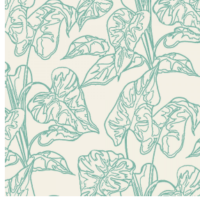
NOLAN Jade 116 Print pattern