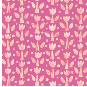
TULIPE Rose 129 Print pattern