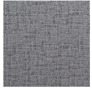
MURA MINERAL 157