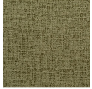
MURA OLIVE 61