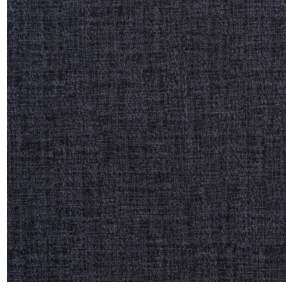
MURA NOIR 10 Print pattern