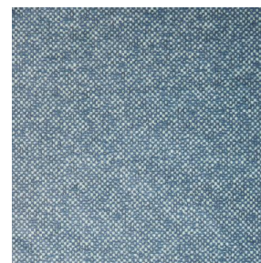
ANATOLE Celadon 135