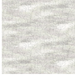
6056 Naturel 26 Print pattern