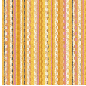
TRAVIS Soleil 127 Print pattern