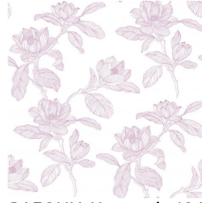
PAEONIA Hortensia 134