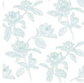
PAEONIA Turquoise 53 Print pattern