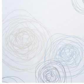
NAHIA OR 94 Print pattern