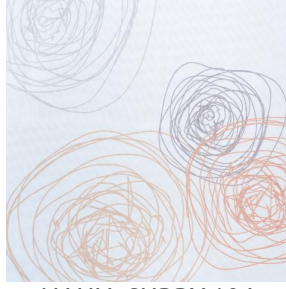
NAHIA CURRY 184