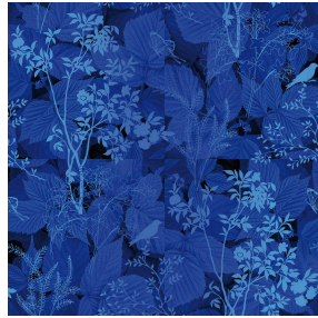
ODE Bleu 41 Print pattern