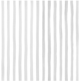
SONG Naturel 26