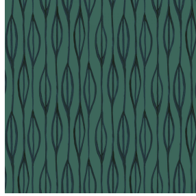
YENDI Sapin 126 Print pattern