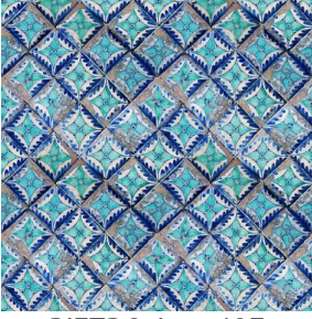
PIETRO Azur 137