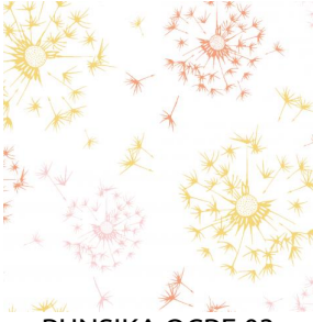
PUNSIKA OCRE 03