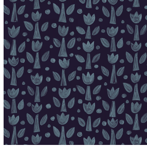
TULIPE Nuit 128 Print pattern