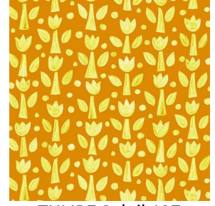
TULIPE Soleil 127