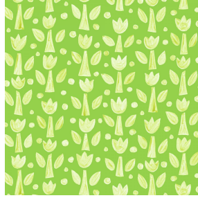
TULIPE Anis 62 Print pattern