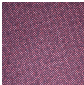
ANATOLE Amarante 108