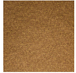
ANATOLE Or 94