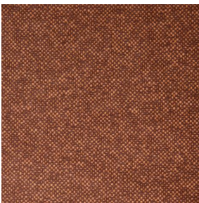
ANATOLE Chaudron 118