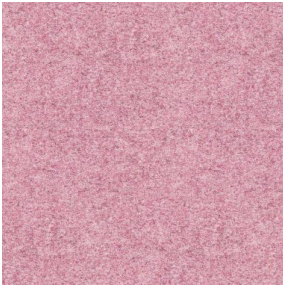
ELAINA Rose 129