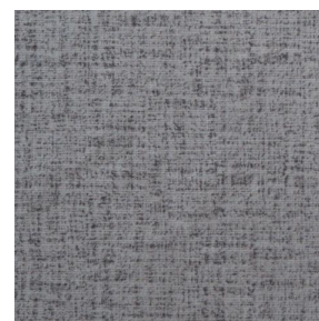
MURA MINERAL 157