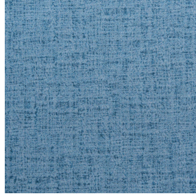
MURA GLACIER 43 Print pattern