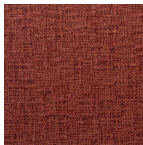
MURA GRENAT 56