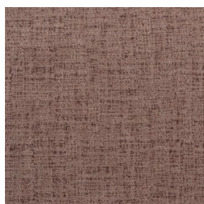
MURA DUNE 170