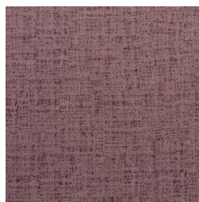
MURA ROSE 129