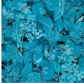
ODE Turquoise 53 Print pattern