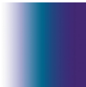
ZENITH Bleu 41