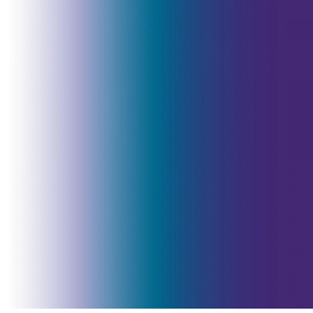
ZENITH Bleu 41 Print pattern