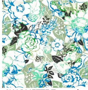
CHARMETTE Turquoise 53