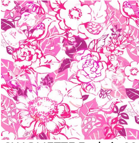
CHARMETTE Fuchsia 33