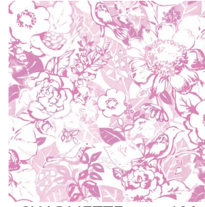
CHARMETTE rose 129