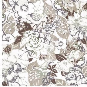
CHARMETTE Taupe 95 Print pattern