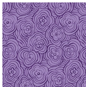
ONDES Violine 105