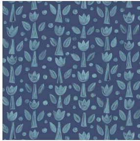
TULIPE Indigo 119