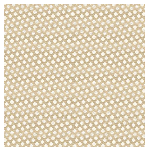
GONIDIE Crème 32