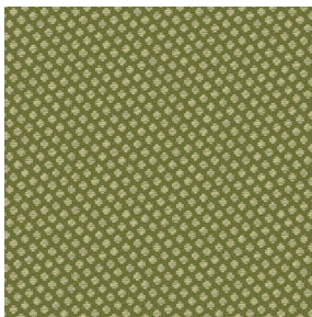
GONIDIE Mousse 92