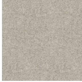
ELAINA Naturel 26 Print pattern