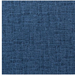
MURA SAPHIR 106