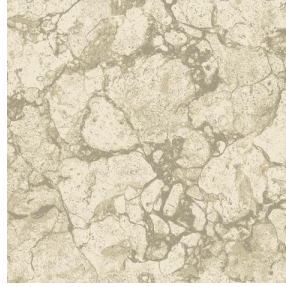
CARRARA Ficelle 09