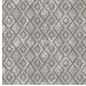
6041 Taupe 95 Print pattern