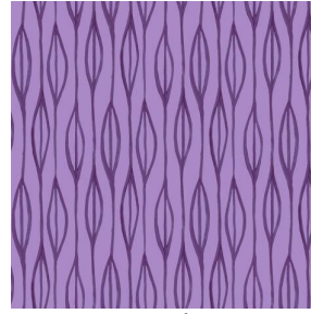
YENDI Lilas 19