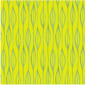
YENDI Anis 62