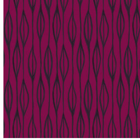
YENDI Opéra 104 Print pattern