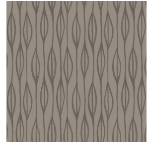
YENDI Terre 107