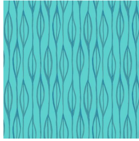
YENDI Lagon 110