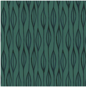
YENDI Sapin 126