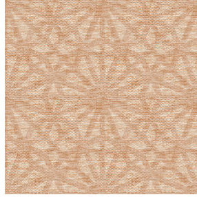
6039 Caramel 174 Print pattern