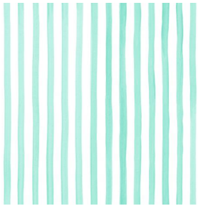
SONG Menthe 122