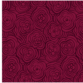
ONDES Opéra 104 Print pattern