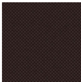
CHARLOTTE Ebene 124