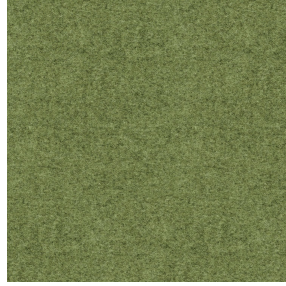
ELAINA Lierre 124 Print pattern