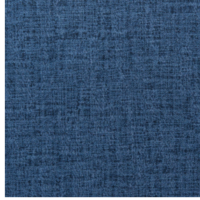
MURA SAPHIR 106 Print pattern