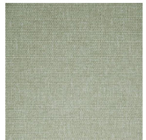
MUNA Sable 67