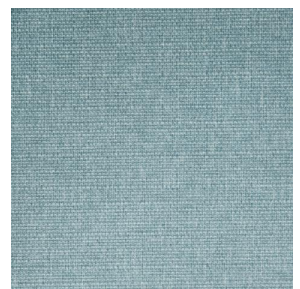
MUNA Ardoise 87