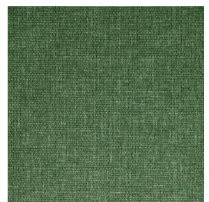
MUNA Lierre 124