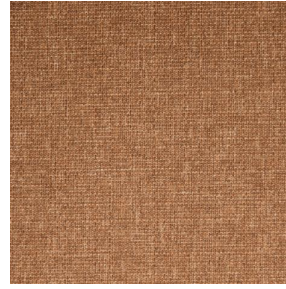
MUNA Sienne 29