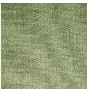
MUNA Tilleul 103