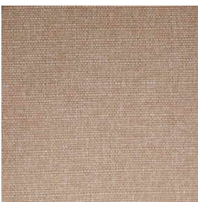
MUNA Saumon 143