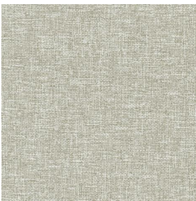
MUNA terre 107