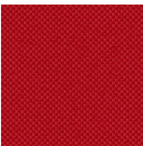
CHARLOTTE Fiesta 131