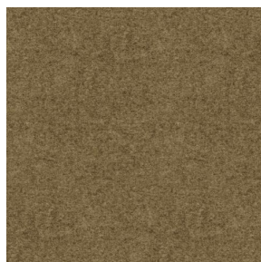
ELAINA Chamois 111