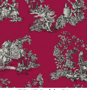
ZELIE Rubis 59