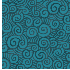
TUMULTE Orage 123 Print pattern