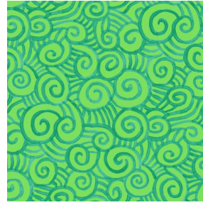
TUMULTE Prairie 125