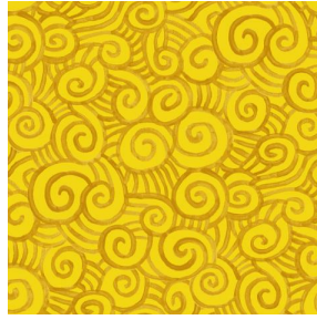
TUMULTE Maïs 37