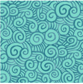
TUMULTE Menthe 122