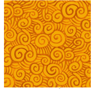
TUMULTE Safran 49