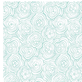
ONDES glacier 43