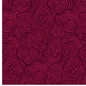
ONDES Opéra 104 Print pattern