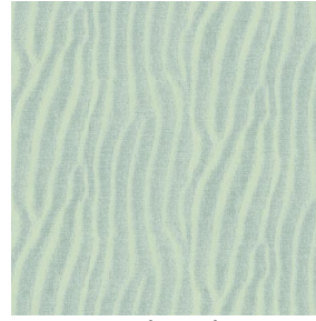
SABLE Absinthe 132