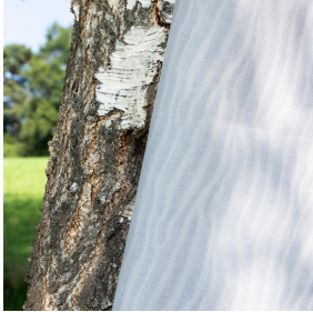
SABLE Ivoire 115 Print pattern