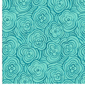
ONDES Turquoise 53 Print pattern