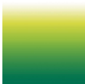
ZADIG Cactus 36