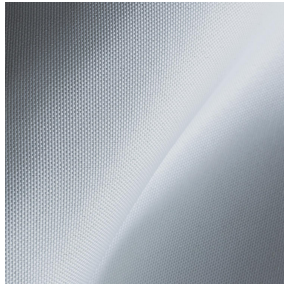
NATTE bpi 00 Printing support