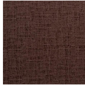
MURA TERRE 107