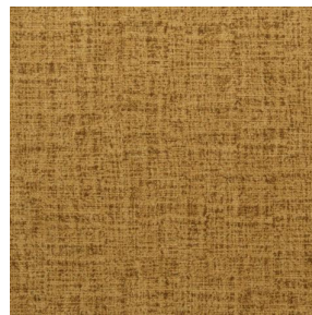
MURA SAVANE 185