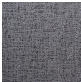
MURA ETAIN 180