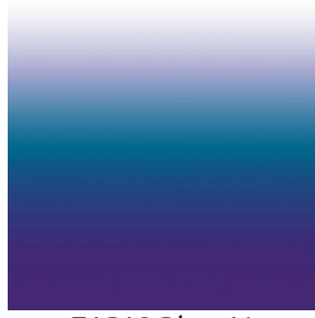
ZADIG Bleu 41